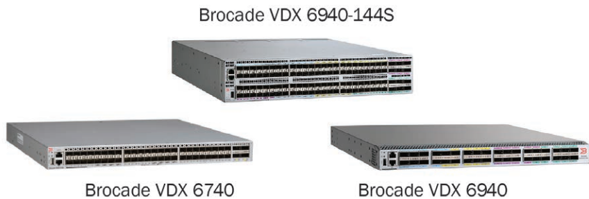
Figure 2: Brocade VDX switches designed for dedicated IP storage networks

Brocade networking solutions help organizations achieve their critical business initiatives as they transition to a world where applications and information reside anywhere. Today, Brocade is extending its proven data center expertise across the entire network with open, virtual, and efficient solutions built for consolidation, virtualization, and cloud computing. Learn more at www.brocade.com .