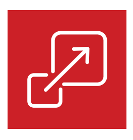
Achieve scalable performance optimized to individual workloads