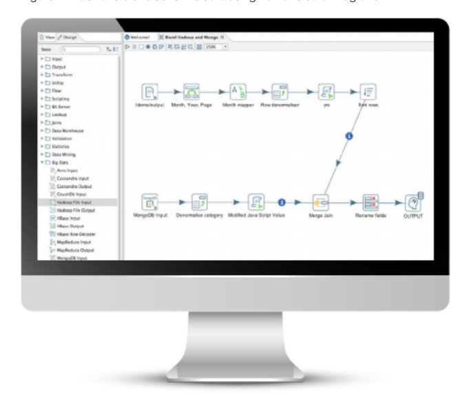
Figure 2. Mask and blend sensitive data using Pentaho data integration

Al-driven automatic identification and enforcement across petabytes of hundreds of millions of columns.