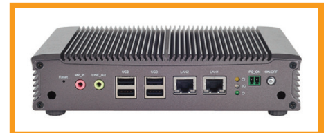
Figure 2. HVP 100 Gateway