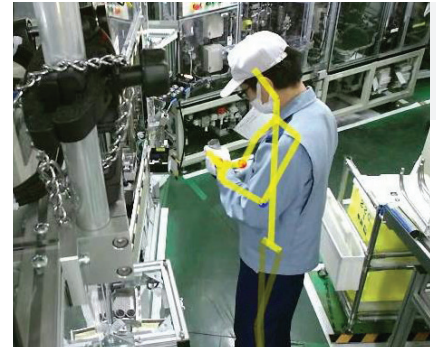
Photograph above: Front-Line Worker

Together, Hitachi and Daicel developed an image analysis system that uses in-depth cameras to measure worker activities. The system detects operational failures in product line facilities and deviations in worker activities in the front lines of manufacturing. Through front-line interviews and observations, the system derives standard behavior models and identifies deviations in worker activities by using statistical comparisons with standard behavior models.