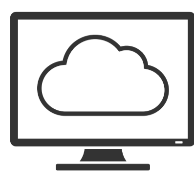
Deploy virtual desktops in hours