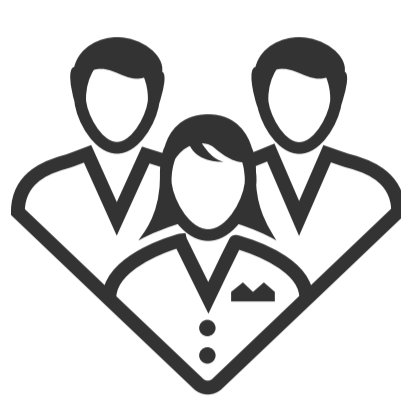
Exceptional user experiences