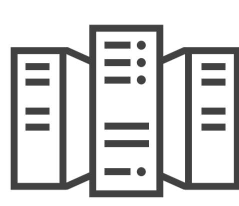
3x more desktops* with Intel® Optane™

* Intel® Optane™ all-NVMe as compared with all-flash HCI