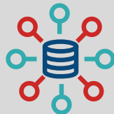
Big Data Integration