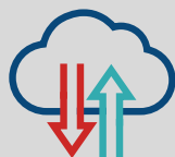
S3 Enabled Applications