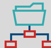
Parallel File System